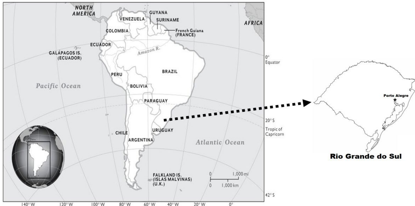
Figure 1 – Map of South America, highlighting Rio Grande do Sul (city of Porto Alegre), Brazil

The research included elderly people aged 65 or over who were hospitalized due to a femur fracture and SCP was performed at the time of admission, in the middle of hospitalization, and at hospital discharge. Patients with two or more fractures, failure to perform SCP at the established times of the study, and who were admitted to the Intensive Care Center (ICU) at the time of the study evaluation were excluded.