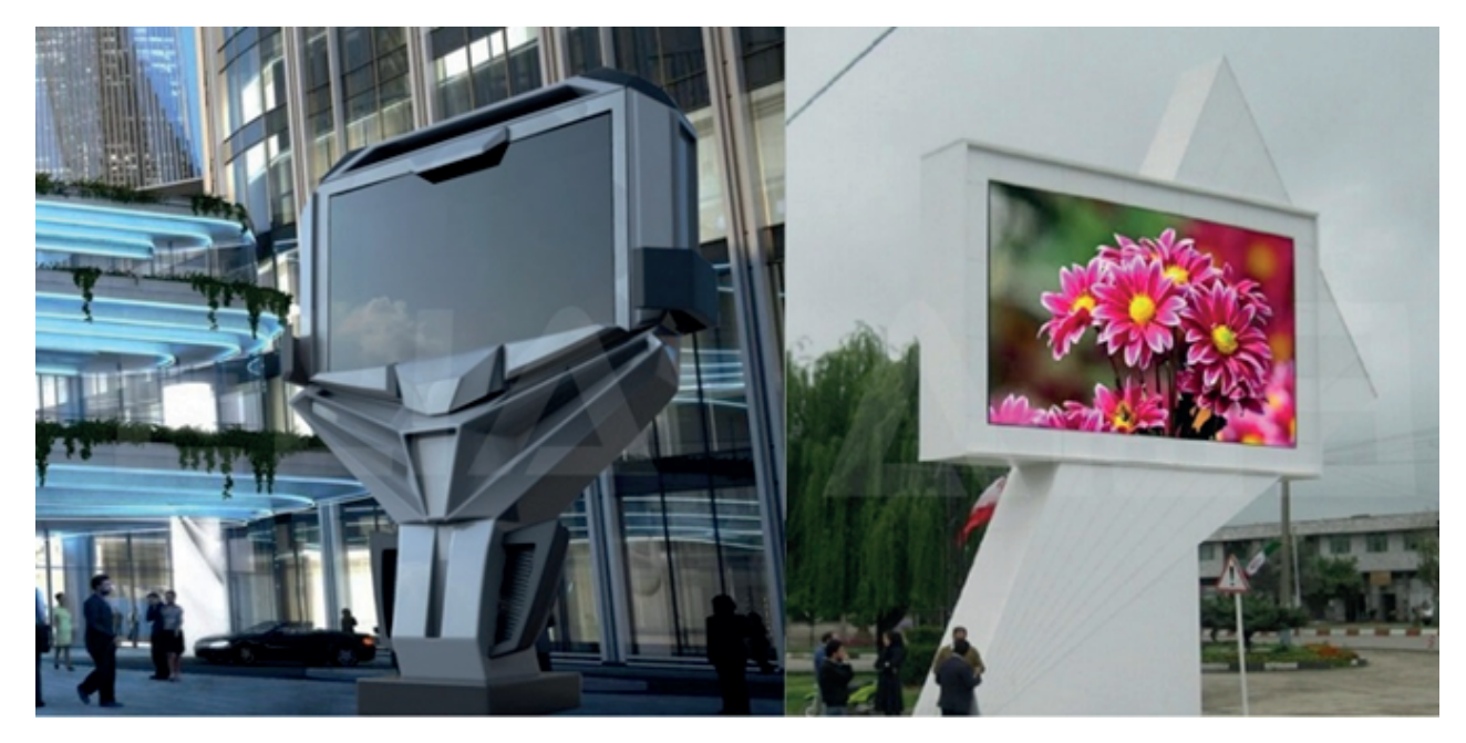
Fig. 5. Some examples of using urban smart TVs

For example, one of the things that waste cost and energy in the municipality of Tehran is printing huge amounts of banners for different ceremonies such as commemoration, congratulations, and condolences, etc. The Banners install for various occasions in the city. But they lost in a few days, and in similar cases, they will not be reusable. In some region of the municipality of Tehran, millions of US dollars spent to buy and install the banners every year. Expensive costs, constantly moving and installation on one hand, and the creation of plastic waste, on the other hand, indicate the inefficiency of this traditional method. While the more modern and economical are in common in the world that is utilizing smart TV which, in addition to its beauty is more costeffective in long-term. Fig. 5, shows two examples of using smart urban TVs instead of banners.