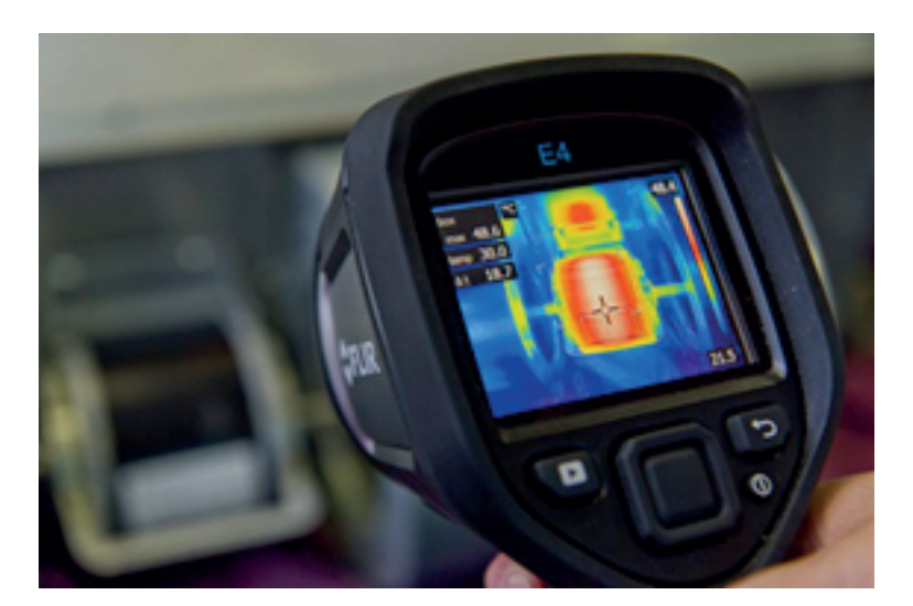
Fig. 1. Smart Thermostat for Energy Saving and Comfort Improvement in Buildings [5]

The advancement of high-frequency antennas for wireless communications is one of the main objectives of the research in the Millimeter-Wave Laboratory in the city University of Hong Kong (City-U). Experts in the lab are designing high-performance antennas to develop 5G wireless communications. With the emerging 5G communications and the transmission of signals in the millimeter-wave spectrum, they continue to develop a variety of high speed and miniaturized antennas to use in many applications. Also, in this laboratory, systems based on wireless sensor networks have been designed and fabricated that have the ability to detect smoke to prevent fire, also, to control the temperature and humidity in the building to maintain the comfort and promote the quality of life. In addition to activating an antitheft alarm, these systems monitor all of the abovementioned via the Internet. In the research teams of the department of architecture and civil engineering in City-U, have made extensive progress in improving the safety of buildings.