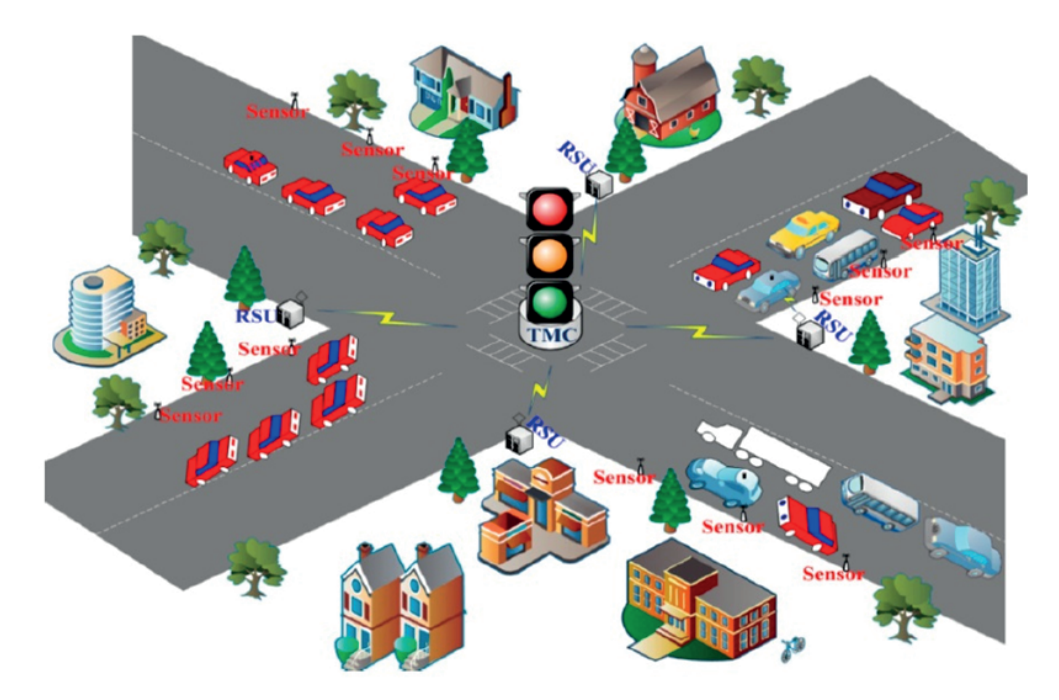
Fig. 2. WSN-based traffic management system (WSN-UTMS) <sup>[6]</sup>.

decision to manage the urban road congestion and considers a priority for emergency vehicles.