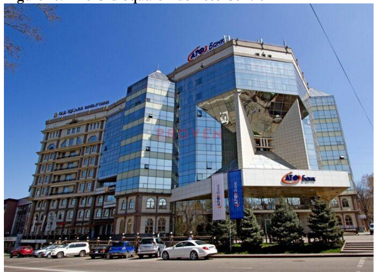
Figure 10. The Old Square Business Centre

The Old Square Business Center is located near one of the main transport arteries of Almaty – at the intersection of Furmanov St. and Kazybek Bi St (Figure 10). This district is home to major administrative, financial, and cultural institutions, shopping, and entertainment centers, hotels, and residential areas. The Old Square is a modern 9-storey business center located in an environmentally friendly district of the business part of Almaty. The building has simple, clear forms combined with tinted stained-glass windows and granite façade. The center is technically equipped using