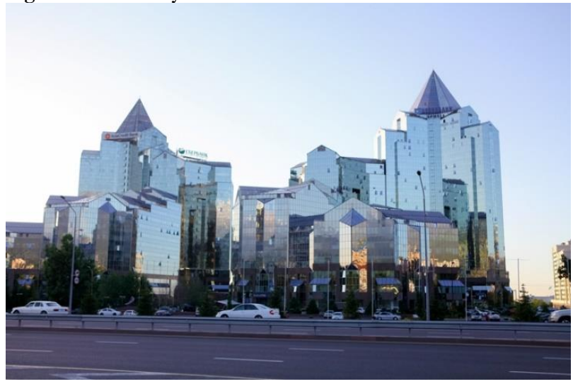
Figure 5. The Nurly Tau Multifunctional Hub

The Nurly Tau can pretend to be the city center. Residential structures with a total area of 180,000 sq. m will be constructed around the center of the esplanade, with apartment square areas ranging from 120 to 214 sq. m, according to the Nurly Tau's general plan. The Nurly Tau's proposed entertainment component will integrate the three most vital aspects of human life: work, home, and leisure. In addition to above-ground guest parking, the complex will have a two-level underground parking structure, with one parking space for every 80 sq. m of the area (Figure 5). The class A office segment is the largest, accounting for around 100,000 sq. m, or 40% of total office space in Almaty's business hubs. The Nurly Tau will have a total office area of 130,000 sq. m. The office size might range from 90 to 1,100 sq. m. The key benefit of this project is its size, which results in a high concentration of a great number of businesses in one location. The "city inside the city" approach is being used to construct the Nurly Tau Multifunctional Hub. With a total area of around 300,000 sq. m, it will be made up of four symmetrically arranged groups of buildings with a