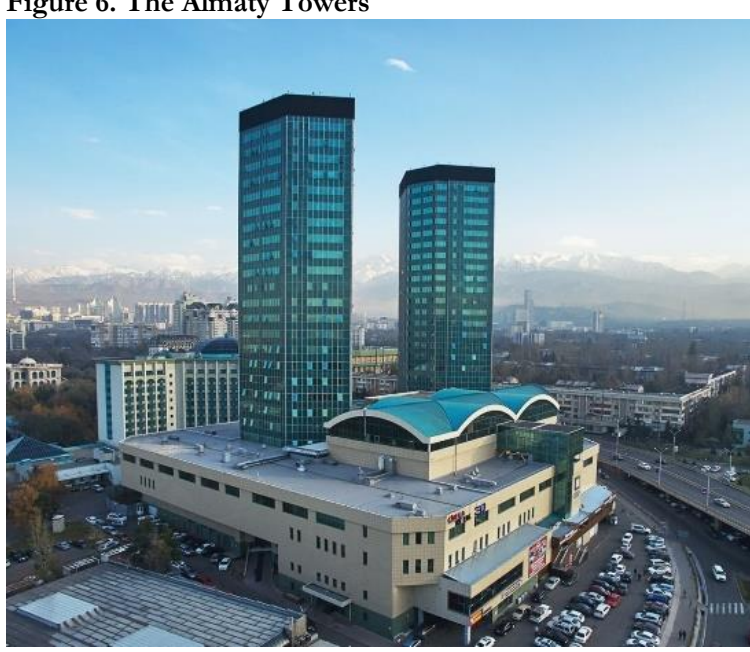
Figure 6. The Almaty Towers

The hub's buildings will be equipped with the latest fire and security systems, uninterruptible power supply, an automatic indoor climate control system, air conditioning and ventilation systems, as well as modern telecommunication systems and high-speed Internet, in accordance with the requirements for class A offices.