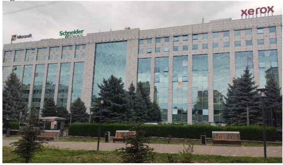
Figure 12. The Ken Dala Business Center

High-rise residential and office building construction is a particularly promising segment of the construction industry. It helps solve one of the most critical problems of large cities: land scarcity. In addition, the commissioning of highend office space will have a significant impact on the market as a whole, leading to market stabilization, demand saturation, and a decrease in the growth of rental costs.