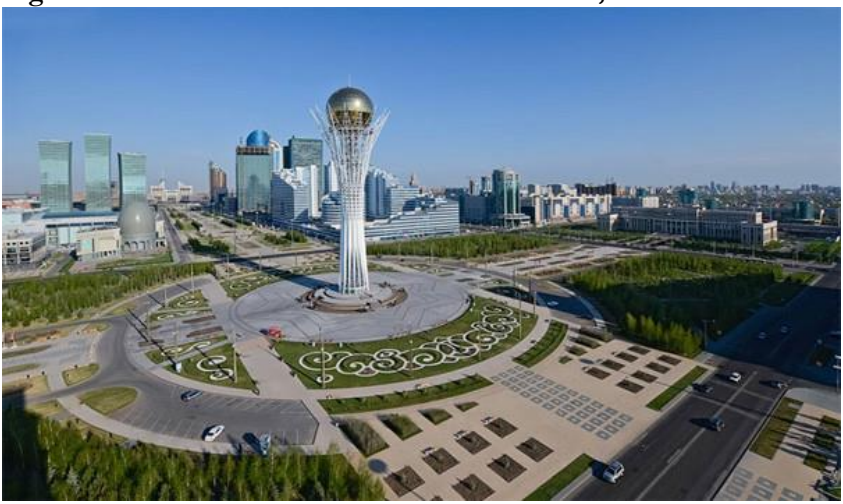
Figure 1. The Government axis and the Baiterek, Nur-Sultan

Two cone-shaped high-rise structures flanking the central path to the presidential mansion resolved the square's plan contradiction, which developed as a result of the presence of three different-sized buildings – the Government, the Parliament, and the Mazhilis. The House of Ministries complex, with its segmental structure, maintains the composition's integrity.