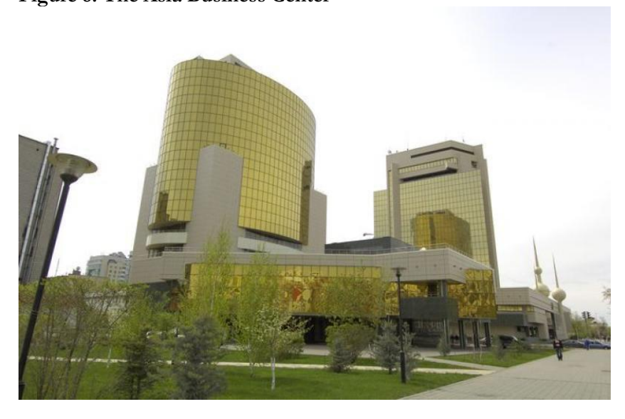
Figure 8. The Asia Business Center

Since 2005, the growth of business activity in the republic as a whole and in Almaty, in particular, has been influenced by the implementation of a program to support small and medium-sized businesses, as well as the creation of a regional