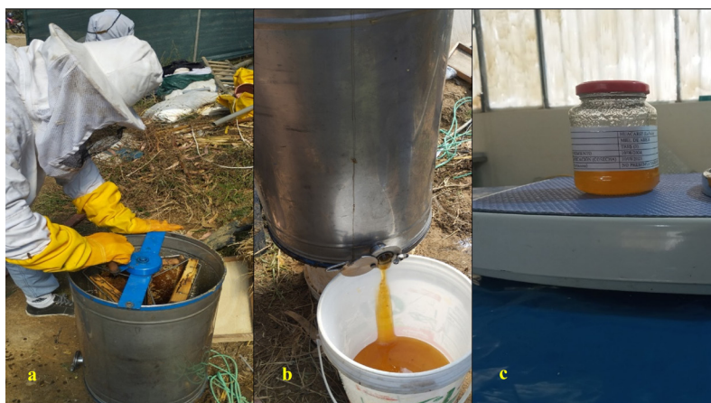
Figure 2. Steps in the honey collection and packaging process: (a) Placement of frames into the manual centrifuge for extraction; (b) Collection of honey after centrifugation and transfer to a plastic container; (c) Packaging of samples into glass jars for shipment to the laboratory.

The concentrations of Cd and Pb were determined using graphite furnace atomic absorption spectrophotometry (GFAAS) (18) , with a Thermo Scientific iCE 3000 spectrometer. Prior to analysis, the honey samples were heated in a water bath to reduce viscosity, weighed, and incinerated in a muffle furnace at 450 °C for 16 hours to eliminate organic matter. The remaining residue was treated with purified nitric and perchloric acids and heated to near dryness. The digested material was then filtered and diluted to a specific volume for analysis.